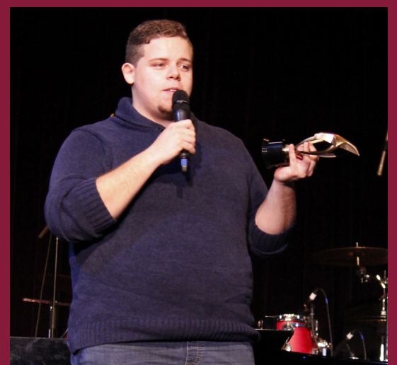
ALBUM/EP/MIXTAPE OF THE YEAR: TRAIN BEYOND TRIUMPH BY TOM ADAMS