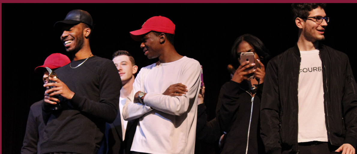
PRODUCTION COMPANY OF THE YEAR (MUSIC): FOURSIX