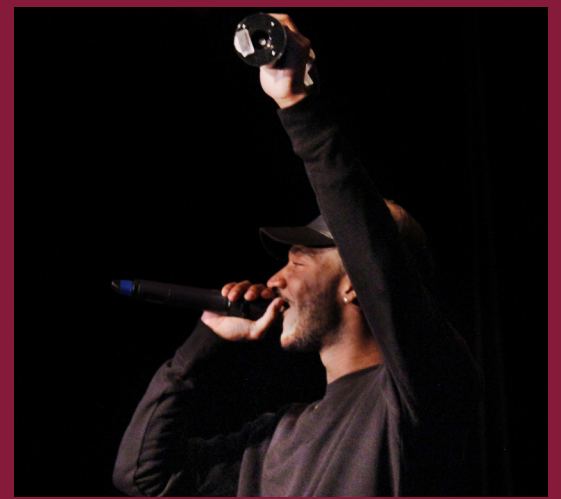
SONG OF THE YEAR: NO TISSUE BY J-PAYSO