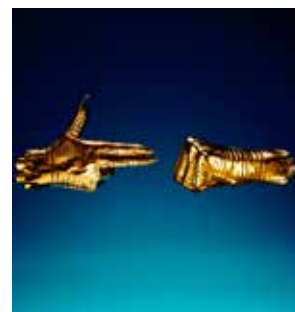
Run The Jewels released their album Run The Jewels 3 and they are by no means stopping at three.