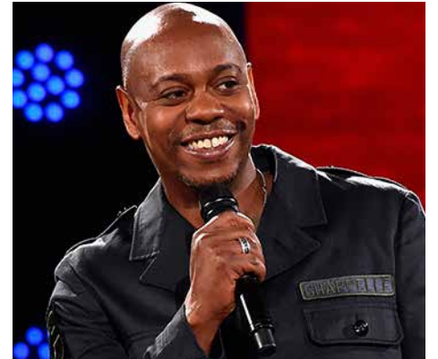
Comedic legend Dave Chappelle has returned with new Netflix specials.

The third Chappelle special will be released to Netflix later this year. Dave Chappelle came and told the world that he's not only back, but he still isn't taking anyone's shit. Not much has changed.