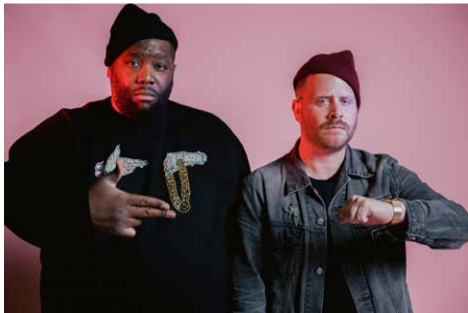
Run The Jewels consists of (left to right) Killer Mike and El-P.

With the group just coming off tour, someone on Twitter replied to El-P thanking him for the final album. El-P replied, “Who said we were stopping at 3?” This group accomplished something very few artists and even filmmakers could do which was to come out with a sequel that was better than the last. As El-P has said, they're “gonna take this fuckin' world back.”