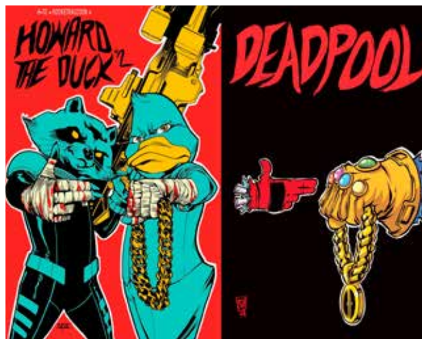
Run The Jewels has gained such traction in pop culture that they're referenced on Marvel comic book covers.