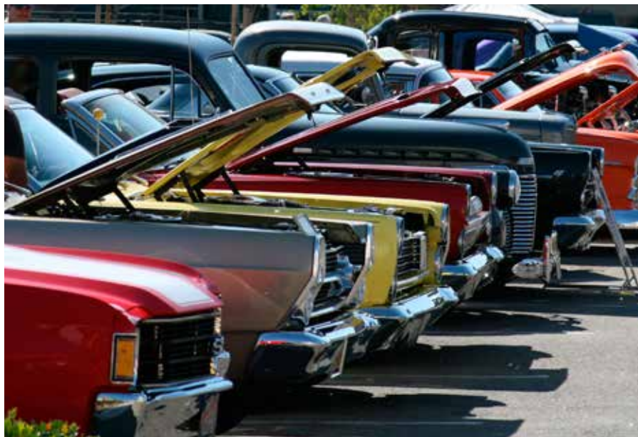
At car shows, you can find unique automobiles or concept vehicles on display.

Though it might not seem like it, there is a difference between a car meet and a car show. While both have been around since the beginning of car culture, they differ in one aspect: the general level of etiquette. Car shows are always an official event usually held at a parking lot or an establishment that has been allowed to gather. Car shows require permission from the property owner and generally have an admission fee, making car meets the easier of the two to orchestrate. Because of this though, it makes for a more mature and calmer environment. It's the perfect opportunity to hold a fundraiser and donate to a cause. It's also where you can find unique automobiles or concept vehicles, cars created by a company as a possible production vehicle, and so on displayed. These events are quite large and attract an awesome crowd from families to dedicated car enthusiasts.