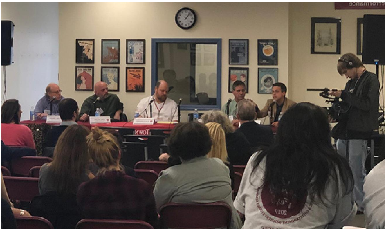
Business panel discussion