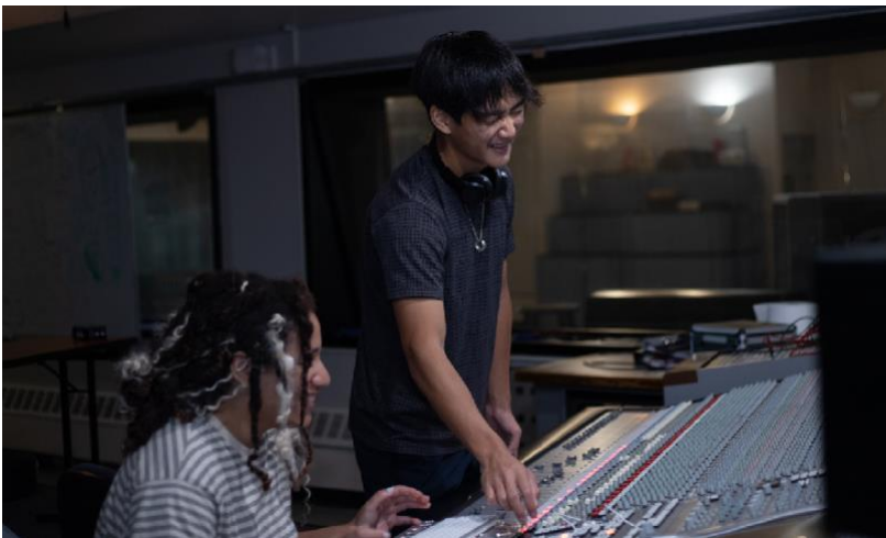
Recording songs in Studio A